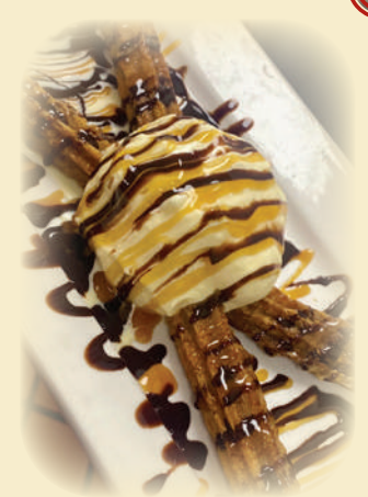
Churros - 8.49