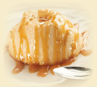
Flan - 6.49