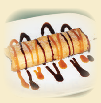
Cheesecake Burrito - 6.74